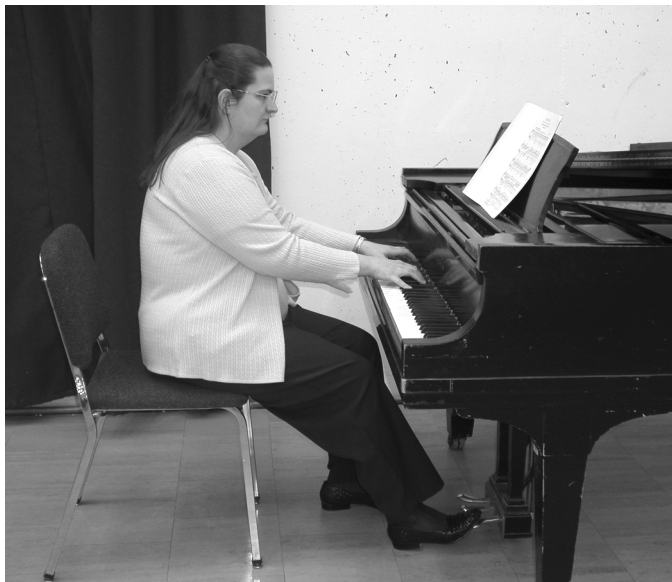
Figure 1. Video Camera Placement: Piano, Keyboard, Harp

Note: The functional keyboard proficiency exercise must be performed on an acoustic piano.