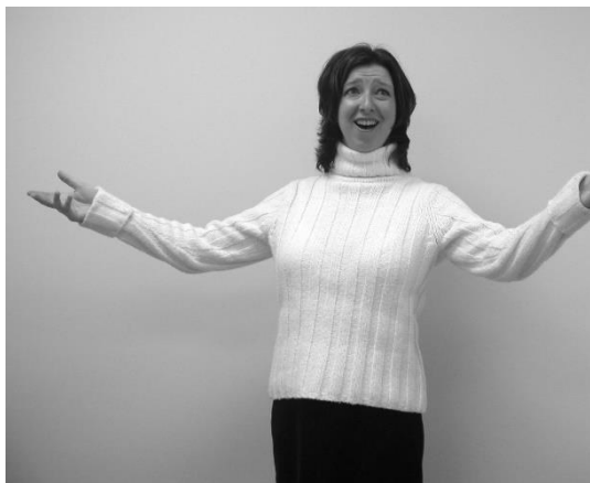
Figure 4. Video Camera Placement: Voice

The video camera should be positioned to show your face and upper torso ( front view ).