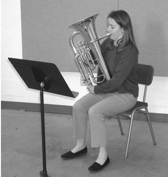
Figure 3. Video Camera Placement: Music Stand

If you read from the assigned score rather than memorize the music, ensure that the music stand does not obscure any of the required views shown on these pages.