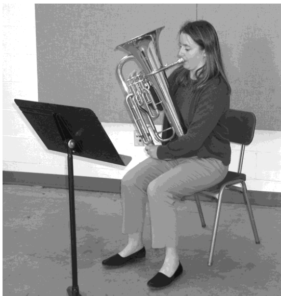
Figure 3. Video Camera Placement: Music Stand

If you read from the assigned score rather than memorize the music, ensure that the music stand does not obscure any of the required views shown on these pages.