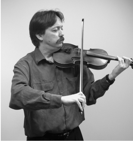
Figure 2. Video Camera Placement: Other Instruments

The video camera should be positioned to show your hands and face ( front or front/side view ).